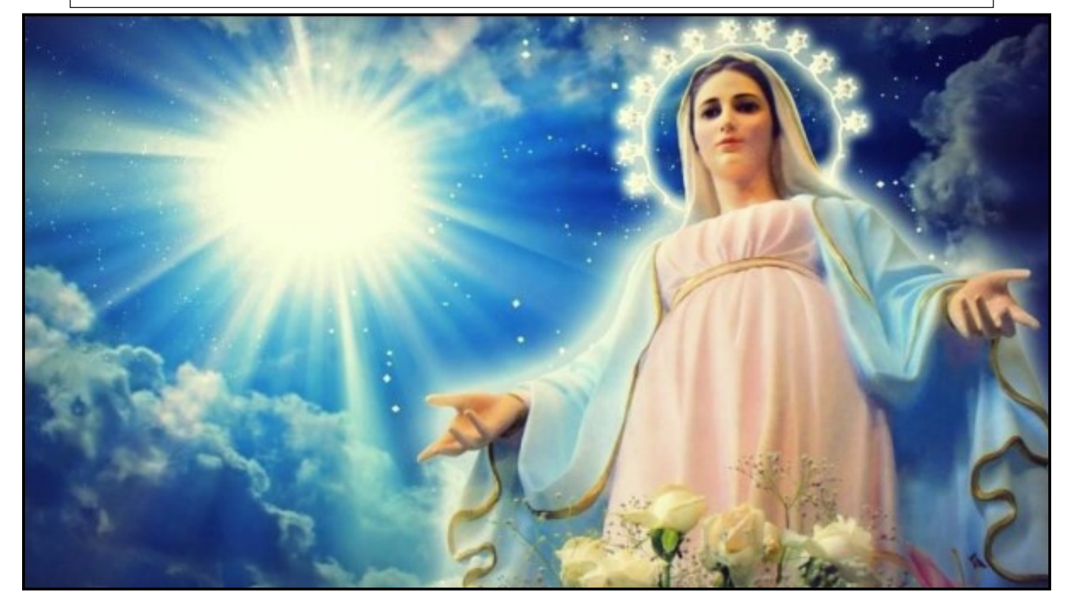
SIXTH SUNDAY OF THE RESURRECTION MAY 5, 2024